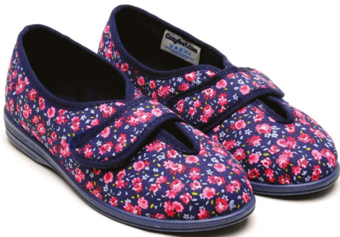
☐ % Navy Floral