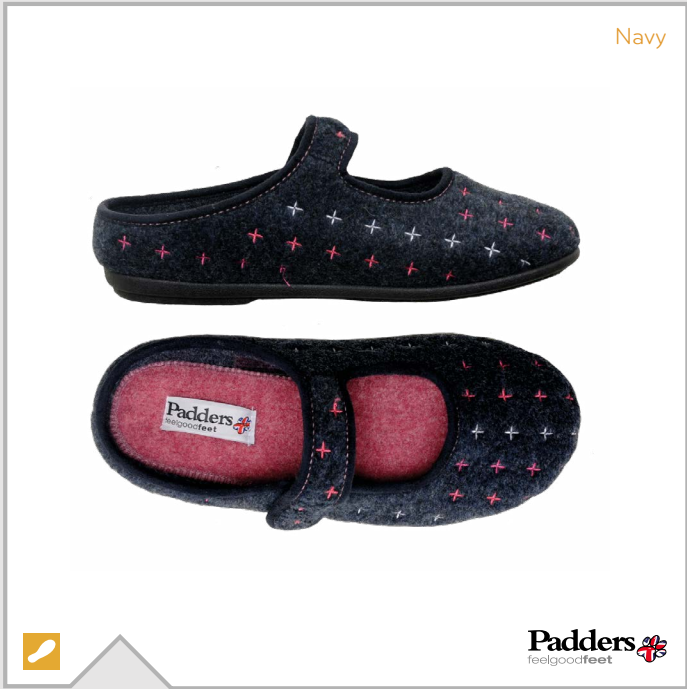
HEIDI | SIZES 3-8 | 2-3E | £30